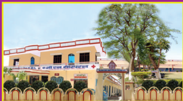
AIUAMC, Muzaffar Nagar