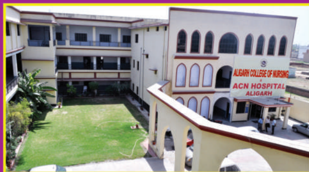
Aligarh College of Nursing, Aligarh