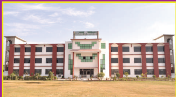
ACN College of Engineering & Management Studies, Aligarh